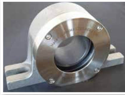
Private labeled parts