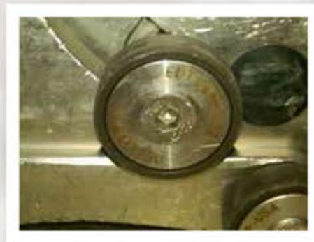
Radial Poly-Round® (RPR) Bearings