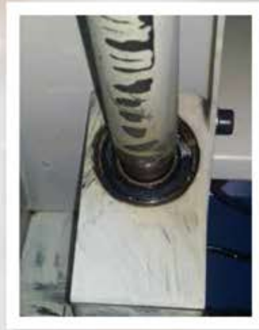
Radial Ball Bearings