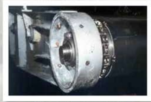
Mounted Ball Bearings