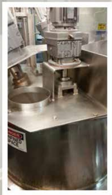
Type E Solution® Bearings