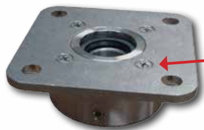
Breader Auger Bearing P/N ZJZA400-0N8-1