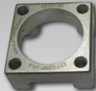
4-Bolt Housing (Stainless) P/N ZA100-QK (Re-use as often as possible)