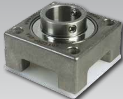
Breader Bearing P/N ZJZA100-QK8-1 (Replaces OEM 3 piece unit)