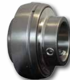
SUC205-16 Stainless Bearing P/N 4Y205-16FX (Replace as often as needed - average 6-12 months)