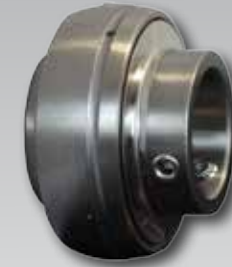
SUC205-16 Stainless Bearing P/N 4Y205-16FX (Replace as often as needed - average 6-12 months)