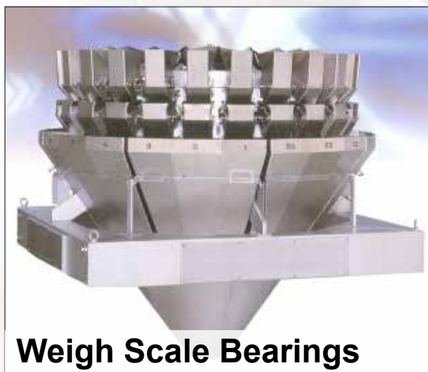
Weigh Scale Bearings