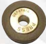
EDT Radial Poly-Round®