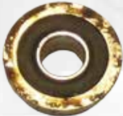
Original ball bearing