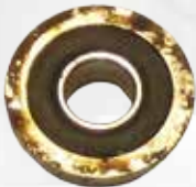
Original ball bearing