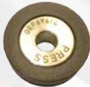
EDT Radial Poly-Round®