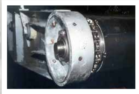
Mounted Ball Bearings