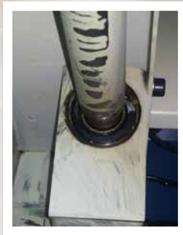
Radial Ball Bearings