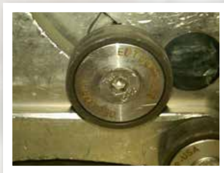
Radial Poly-Round® (RPR) Bearings