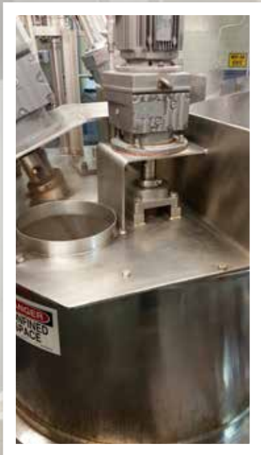
Type E Solution® Bearings