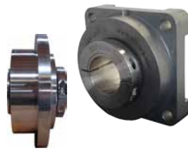
Solid or split styles: pillow block, four bolt, pilot

Retrofit tapered or spherical roller bearings