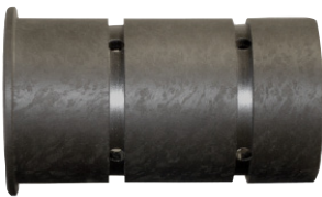
Bearing P/N 2060974BH