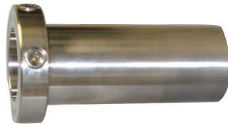
Locking sleeve P/N 2060974LS-R1