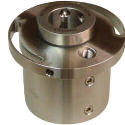
Eccentric housing P/N 2245801